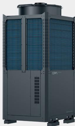
ERA master 50