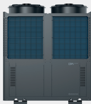
ERA master 100